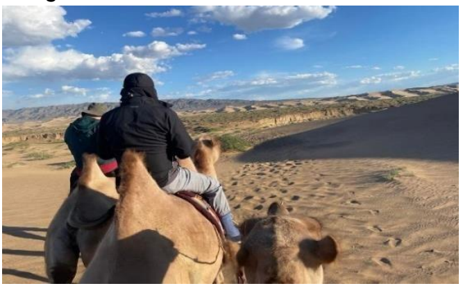
DAY 04: KARAKORUM & ERDENE ZUU MONASTERY - UGII LAKE (BREAKFAST / LUNCH / DINNER)

After breakfast, we will head to see the horse racing at Hui Doloon Hudag. Then excursion continues to Kharkhorin, a small village, and one of the country's major tourist destinations. Historically it was once the ancient capital of the Mongol Empire and the most important city in the history of the Silk Road.