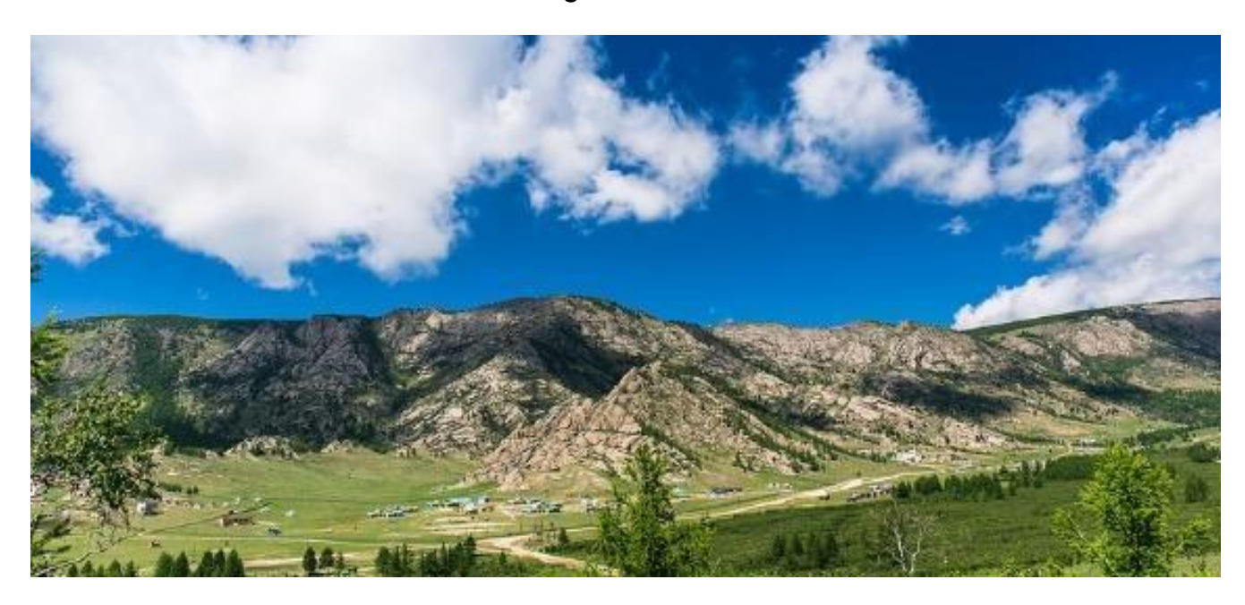
DAY 09: GENGHIS KHAN'S STATUE COMPLEX - ULAANBAATAR HALF-DAY CITY TOUR (BREAKFAST / LUNCH / DINNER)

Distance: 76km. - About 2 hours driving time.